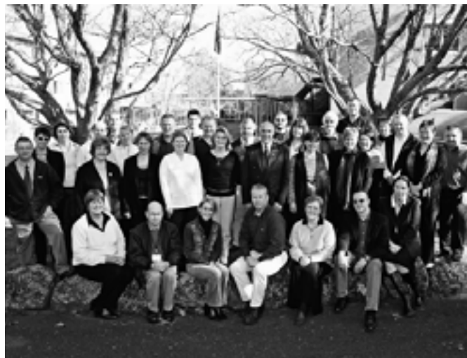
EMA staff, Mt Macedon, Victoria 2005

EMA developed a Senior Executive Program to address the critical leadership and decision-making skills required in times of uncertainty that have both political and