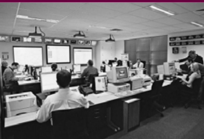
Staff from Emergency Management Australia at work in the National Emergency Management Coordination Centre in Canberra.

The operation clearly demonstrated the ability of all levels of government in Australia to pull together and coordinate an appropriate response.