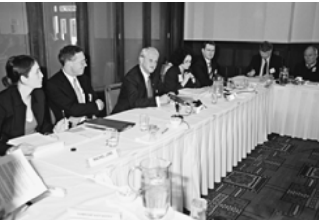
Attorney-General, The Hon Philip Ruddock MP, addressing the 13th Non-Government Organisation Forum on Domestic Human Rights 17 June 2005

The new framework outlines the Government's priorities for enhancing the